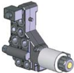
The SVL-300 as a standalone valve is pre-machined for all auxiliary options including an extra tank connection for cross-over relief valve anti-cavitation

By offering a compact valve such as the SVL-300 on their machines, equipment manufacturers will find that they can equip loaders with the standard equipment required by their customers, while at the same time providing a means for the economical upgrading of options after the initial