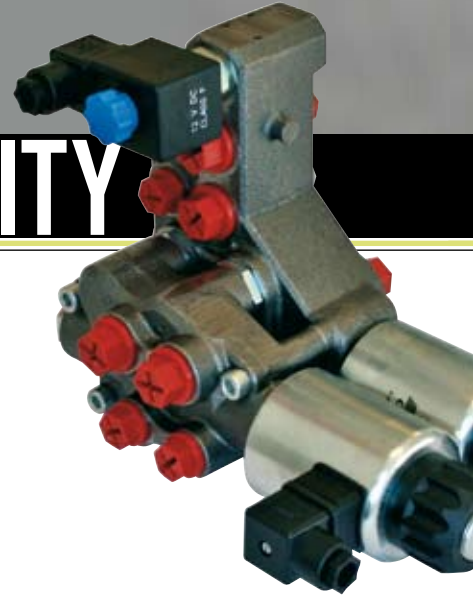
The SVL-300/400 combination provides third and fourth functions without the need for large amounts of space, while still allowing for inline connections with all hoses and piping

The standard SVL-300 valve's hydraulic functions include an electrical 6/2 circuit selector valve for any third function operation on the loader, a dual-relief valve for bucket cylinder protection, and the option of either a manually or electric-operated control valve for switching on the accumulator that controls the loader's comfort ride function.